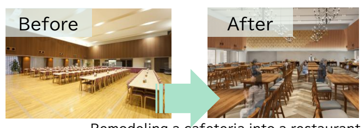
Remodeling a cafeteria into a restaurant