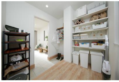
Soil space with high storage capacity