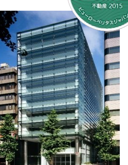
Toranomon Tosei Building

About Certification for CASBEE for Real Estate Certification for CASBEE for Real Estate is a system in which a third party examines and certifies assessment results prepared in accordance with CASBEE for Real Estate (formerly CASBEE for Market Promotion), an evaluation system that ranks buildings and structures in terms of their environmental performance. The system assesses buildings across a broad range of considerations including their energy and resource efficiency, recycling activity and environmental load as well as considerations for protecting biodiversity.