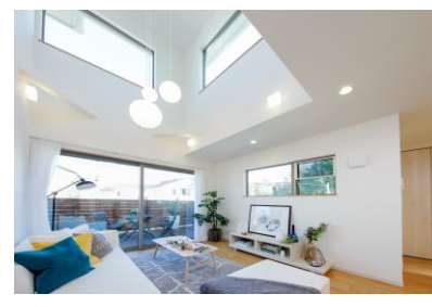
Atrium living room

In the detached house development business, the Group proposes residences that are comfortable for all family members in response to increasingly diverse lifestyles, including the rise in households where both partners work. At certain houses in The Palms Court Kamakura Shiromeguri, we have planned houses where all family members can easily take part in family chores, considering the line of flow. In product planning, we focused attention on the views of women, who support the lives of family members through family chores and child rearing. A project team consisting chiefly of female employees is responsible for the project from planning to development to create more comfortable houses.