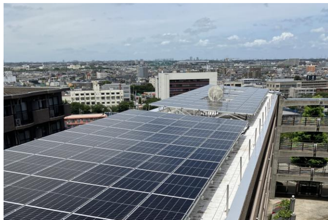
Solar panels installed on the rooftop (325 panels total)