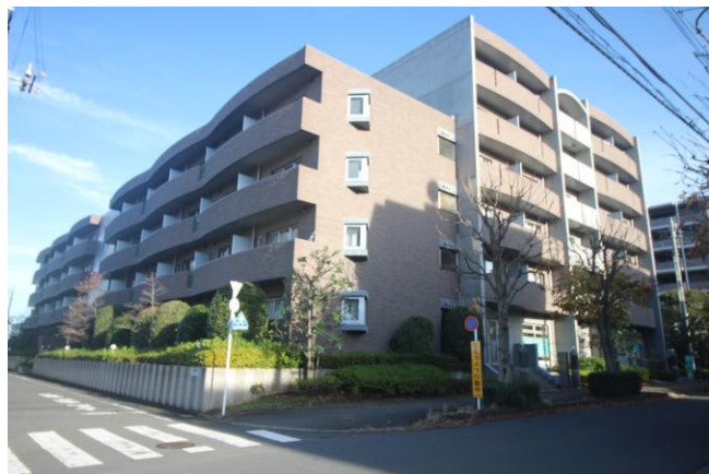
Exterior view of subject property