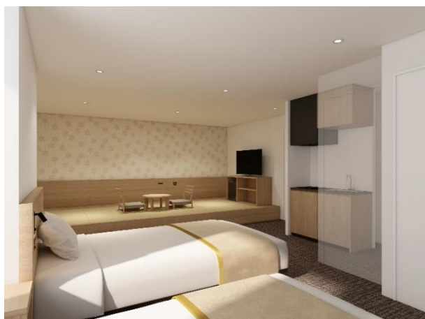
Deluxe twin room of Japanese modern style (with Kitchen)

The Hotel offers rooms with kitchens, the first in the COCONE series, to cater to inbound group travelers for long-term stays, etc. The Hotel also offers single rooms, twin rooms and double rooms as well as bunk rooms to meet a wide range of needs such as domestic tourism and business use. In terms of facilities, the Hotel has a large public bath with a good reputation at other COCONE Hotels, a breakfast restaurant, sauna and other facilities. We create a place where guests may enjoy a comfortable and memorable stay.