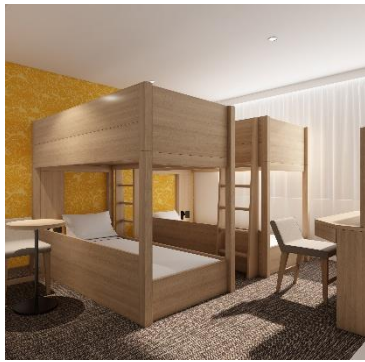
Bunk room (up to 4 people)